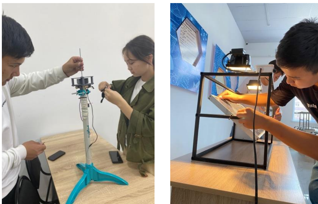
Figure 2 – Technology Circle “Young radio engineer”

For example, students used the empirical method in practical research work and developed generators, familiarizing themselves with the functions of equipment (Figure 3).