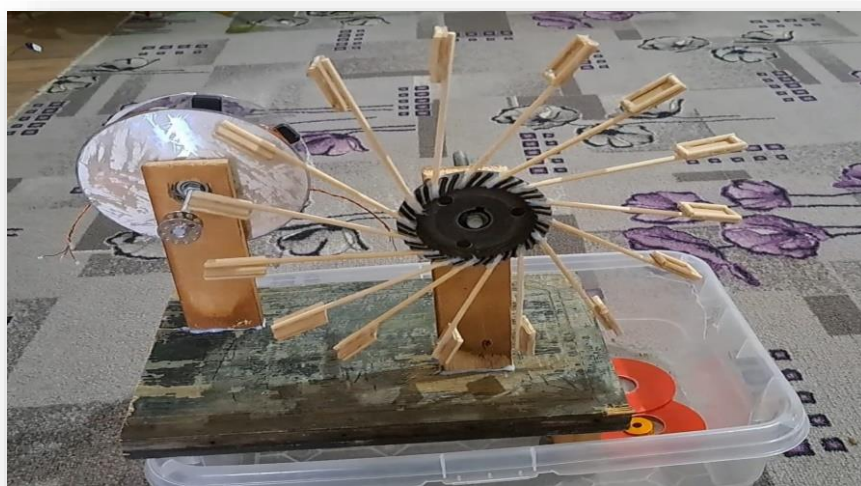
Figure 3 – Practical work of students

For example, students used the empirical method in practical research work and developed generators, familiarizing themselves with the functions of equipment (Figure 3).