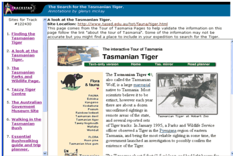
Screenshot 2. [http://trackstar.4teachers.org/trackstar/help/tutorial/find/find.jsp#thm_std]

I tried to check the effectiveness of using Track star online programs in improving vocabulary within the 10 th grade as the experimental training in Ataturk school. We had experimental training with the graduate student. Firstly, we assembled websites, entered them into Track Star, and added annotations for students to use, turning the site into something similar to a web request. I used the already-created tracks due to the option for teachers to search. Cause teachers can find resources by class, subject, or topic. Due to the Track star, I had a test which was consisted of multiple choice, true/false, and short answers according to the text below.